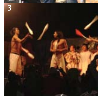
1 Ade Bantu (Photo by Anthony Turner) 2 Bi Kidude (Photo by Masoud Khamis) 3 Bassekou Kouyate @ Ngoni Ba (Photo by Masoud Khamis) 4 Yunasi