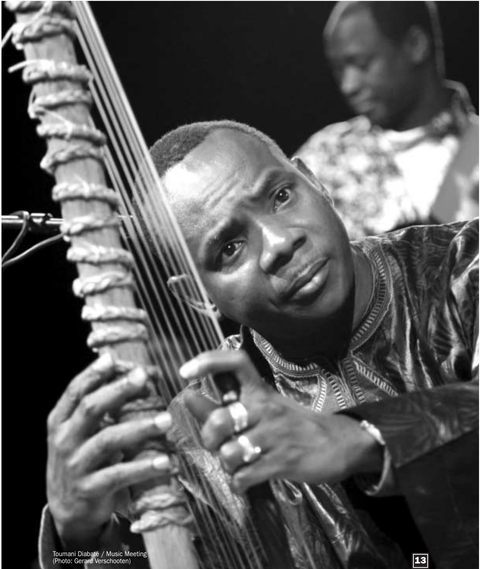
Toumani Diabaté / Music Meeting