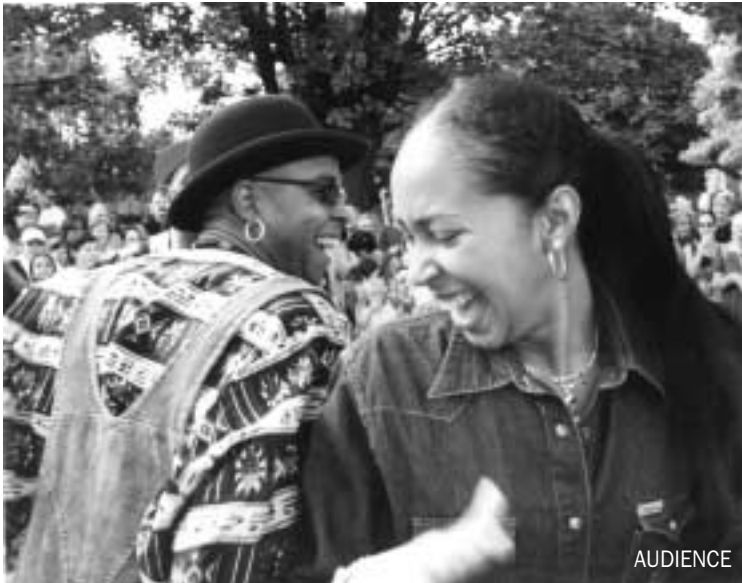
AUDIENCE TRIO BULGARKA