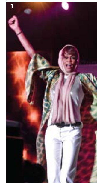
1 Whitney Houston (Photo by Lotfi Rachidi) 2 Dee Dee Bridgewater, (Photo by Driss Ben Malek) 3 Juanes (Photo by Lotfi Rachidi)